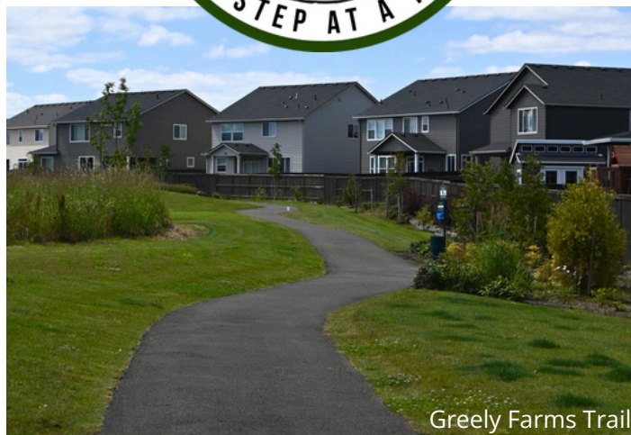
Greely Farms Trail